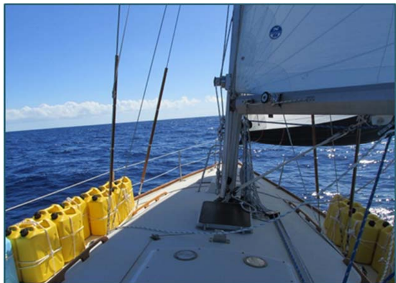
Students learn to prepare the yacht before departure.

Bermuda to Rock Hall, MD- November 16- November 24, 2025. 140 nautical miles on the Chesapeake Bay and 615 nautical miles on the ocean. Nine days including five and a half days from Bermuda to Norfolk, VA and three days from Norfolk, VA to Rock Hall, MD.